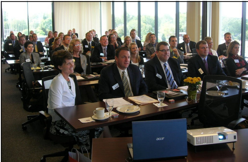
Members of the IALP Class of 2014 and their guests gather for the orientation seminar at Western Illinois University. The event featured presentations about the IALF organization, business attire, dining etiquette, and a discussion of the program by alumni.