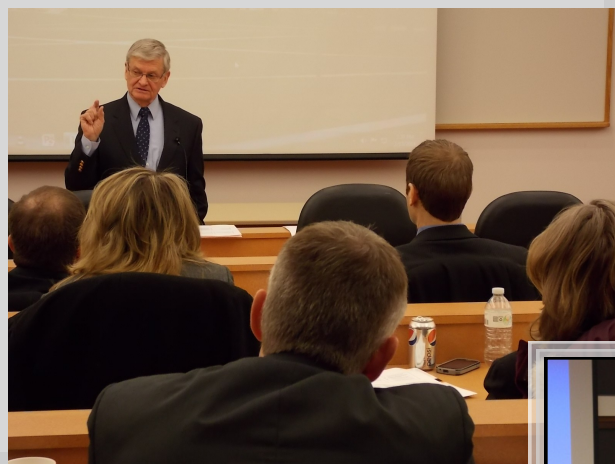
The Class of 2014